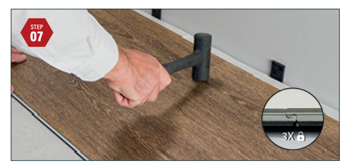
ENGAGE 3<sup>8D</sup> PLANK ON SHORT SIDE (Part II) Using a rubber mallet slightly tap the joints on the short side to secure. This ensures 3x locking.