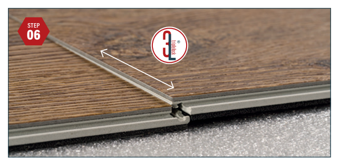
ENGAGE 3<sup>RD</sup> PLANK ON SHORT SIDE (Part I) Using the 3L TripleLock one piece drop-lock system, drop the short side of plank 3 onto the short side of plank 1.

Take another long plank (3). Repeating the previous step, insert the long side of plank 3 into the long side of plank 2. Then slide plank 3 to your left until the short side is in contact with the short side of plank 1.