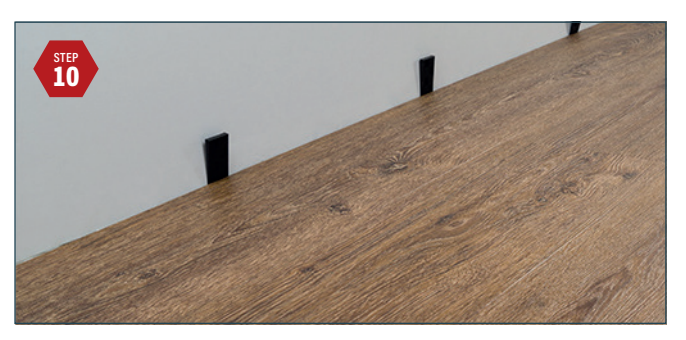
FINALIZE FLOOR Finished? Remove spacers and cover gaps with a trim.

As you go, don't forget to use a rubber mallet on the short sides to secure the locking.