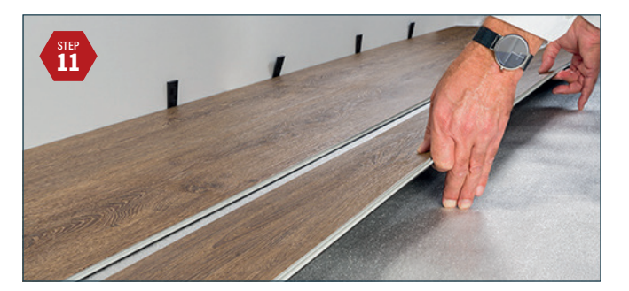
DISASSEMBLING THE LONG SIDE Lift up the entire row in the same angle as you did during installation, then slide the rows apart.