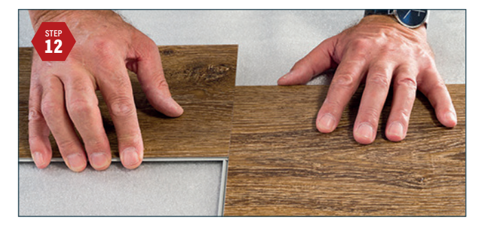
DISASSEMBLING THE SHORT SIDE Disassemble the row by sliding apart the planks on the short side.